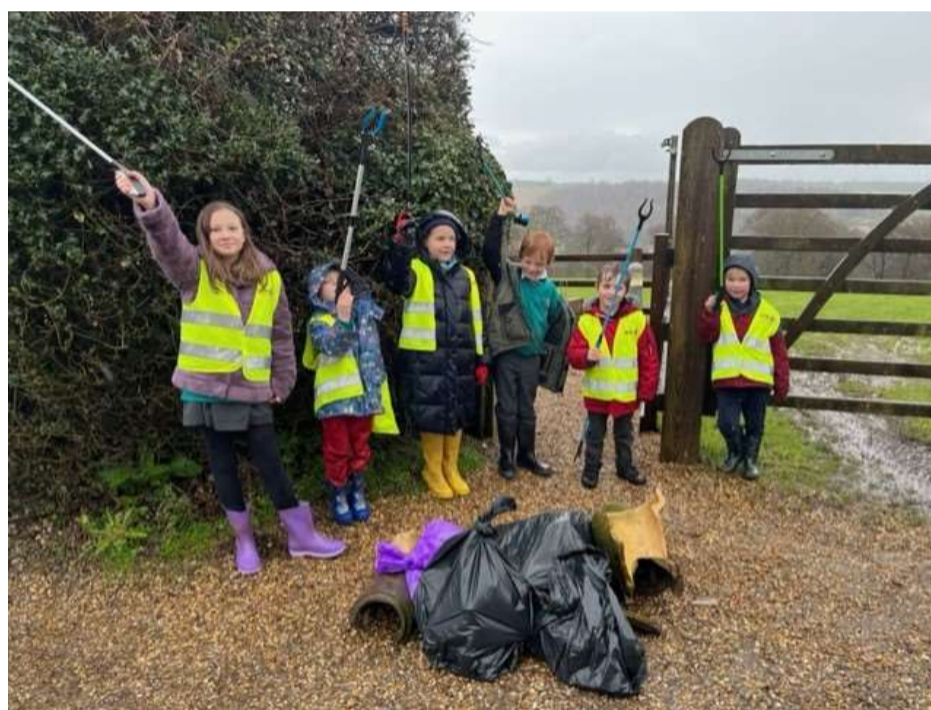
Some of our litter picking team!